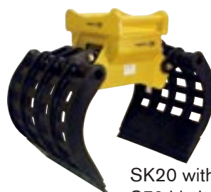
SK20 with S70 hitch