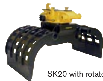
SK20 with rotator